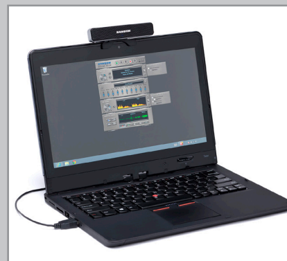
Free Samson Sound Deck audio software download available