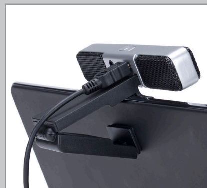
Clips atop your laptop or computer monitor